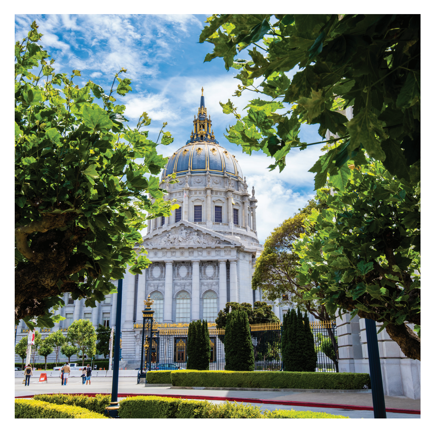
Plan Year 2020